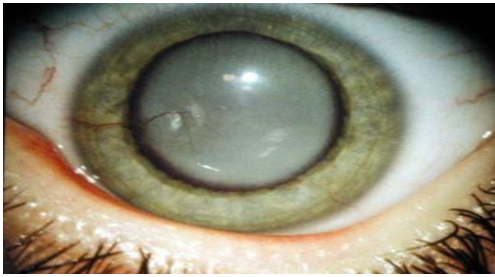
A severe cataract